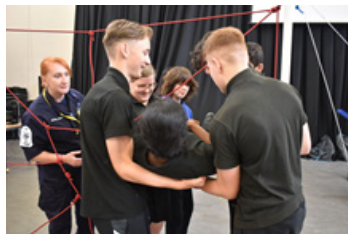
Evacuate the building