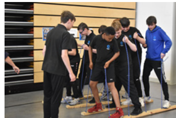
Walk the plank